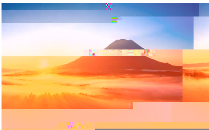
Sunrise in Niseko - one of Stuart's families favourite places to visit and relax.