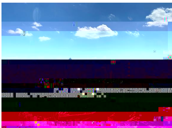
The view from his office window, looking out over the Ginza shopping district and Marunouchi in Tokyo.